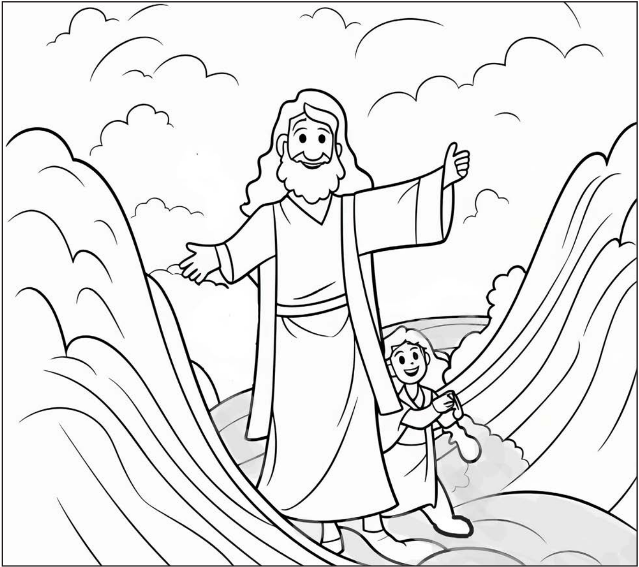
God helped Moses by parting the Red Sea.