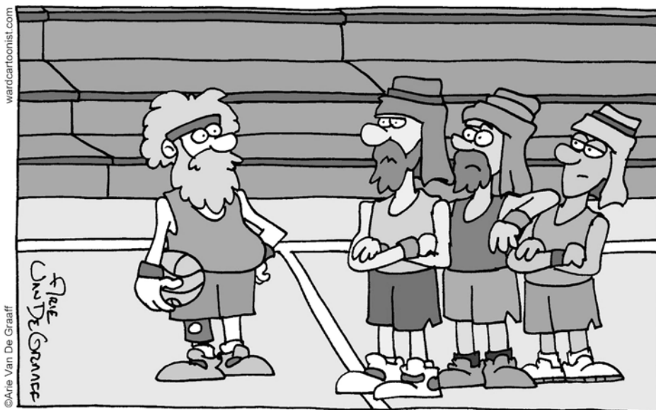
AFTER SINGLE HANDILY TAKING DOWN THE PRIESTS OF BAAL, AN OVERCONFIDENT ELIJAH NEXT CHALLENGES THE PRIEST OF BALL.

T J P G C J Y M F N U E A R T O O Y H W R O O D T R H H S F U U A C R V T N E Z E N C R I T R S Q I U R Z I K R N E L K E T A F F T I B A Y U T S T B Z W W I C E T U C K B D G O N E A S R G O H O I F D U Y N I Z H E A W S S L L E O S T E J U D L S E A E P J E G E P S Z N R O W C P O E G L P O J S P M X C I A L E W E I P J V R H A N N F F E F O N U R T U P H Y Q K F L L D O W I K F T W V O U Q F P D R G J X R M Z R V T A B P P Y A F Z M Y Y L G