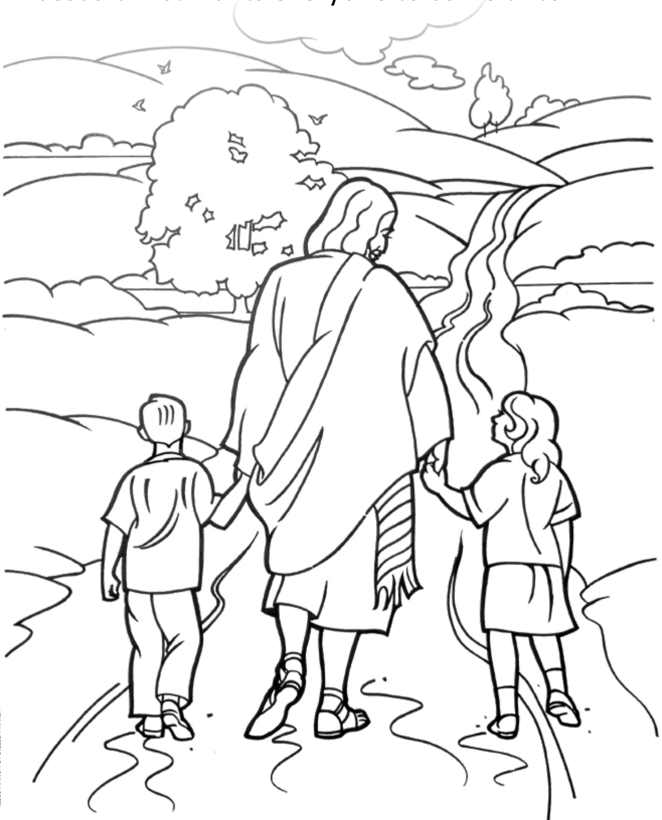
ILLUSTRATION BY DILLEN MARSH

Jesus Christ wants everyone to come unto him