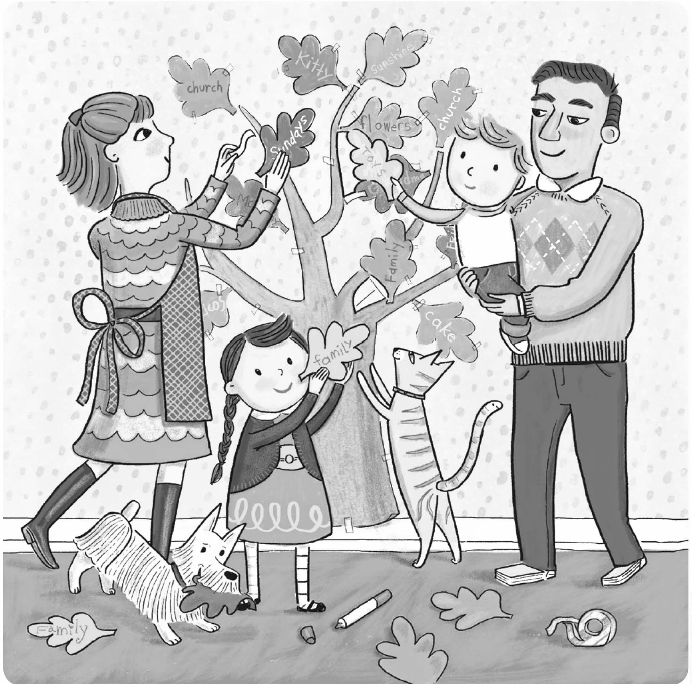
ILLUSTRATION BY VIOLET LEMAY

This family is building a gratitude tree all through November. Every day each person writes something they're thankful for on a paper leaf and tapes it to the tree. Can you find the one thing that's written on three different leaves? Can you find the hidden objects?