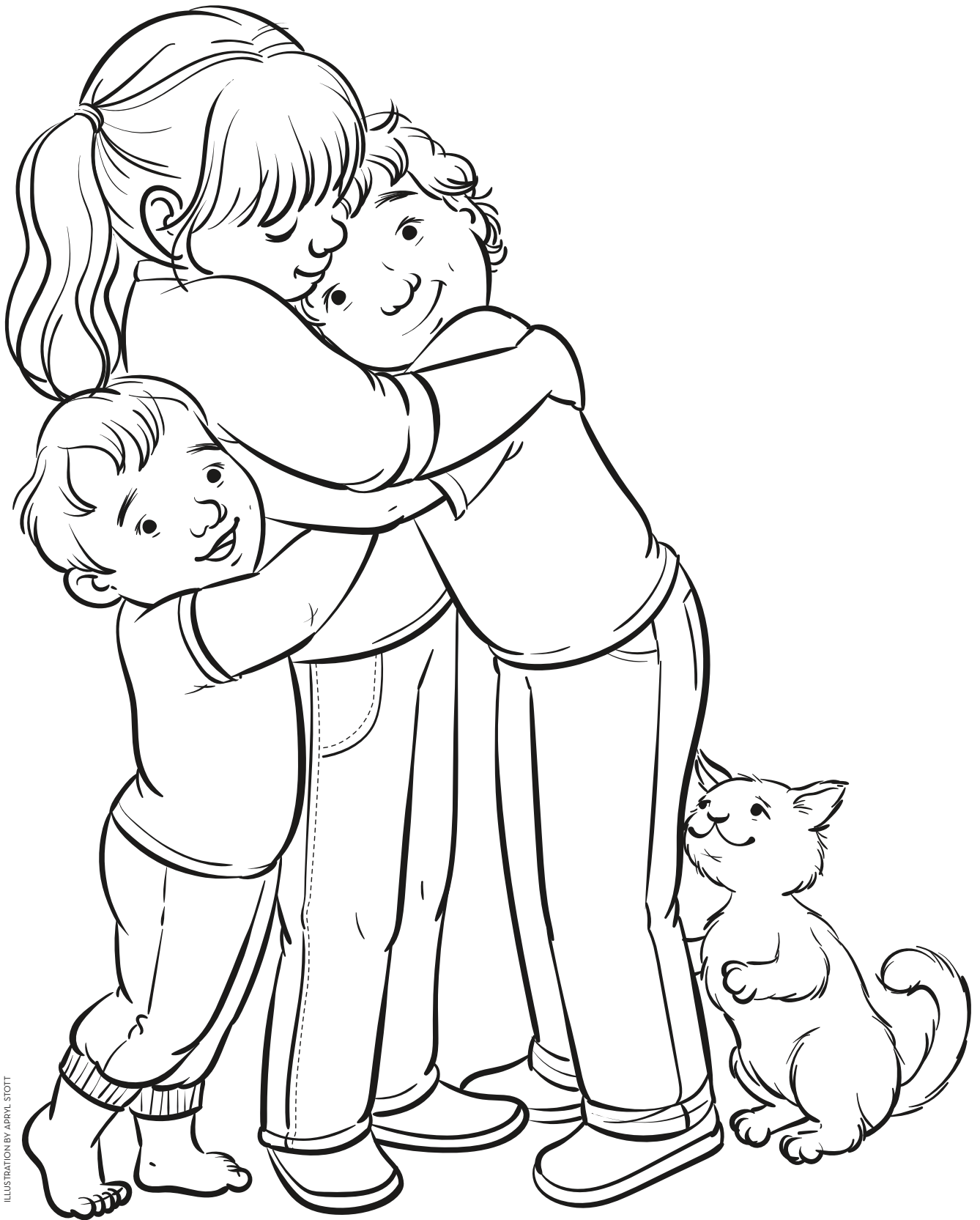
ILLUSTRATION BY APRYL STOTT