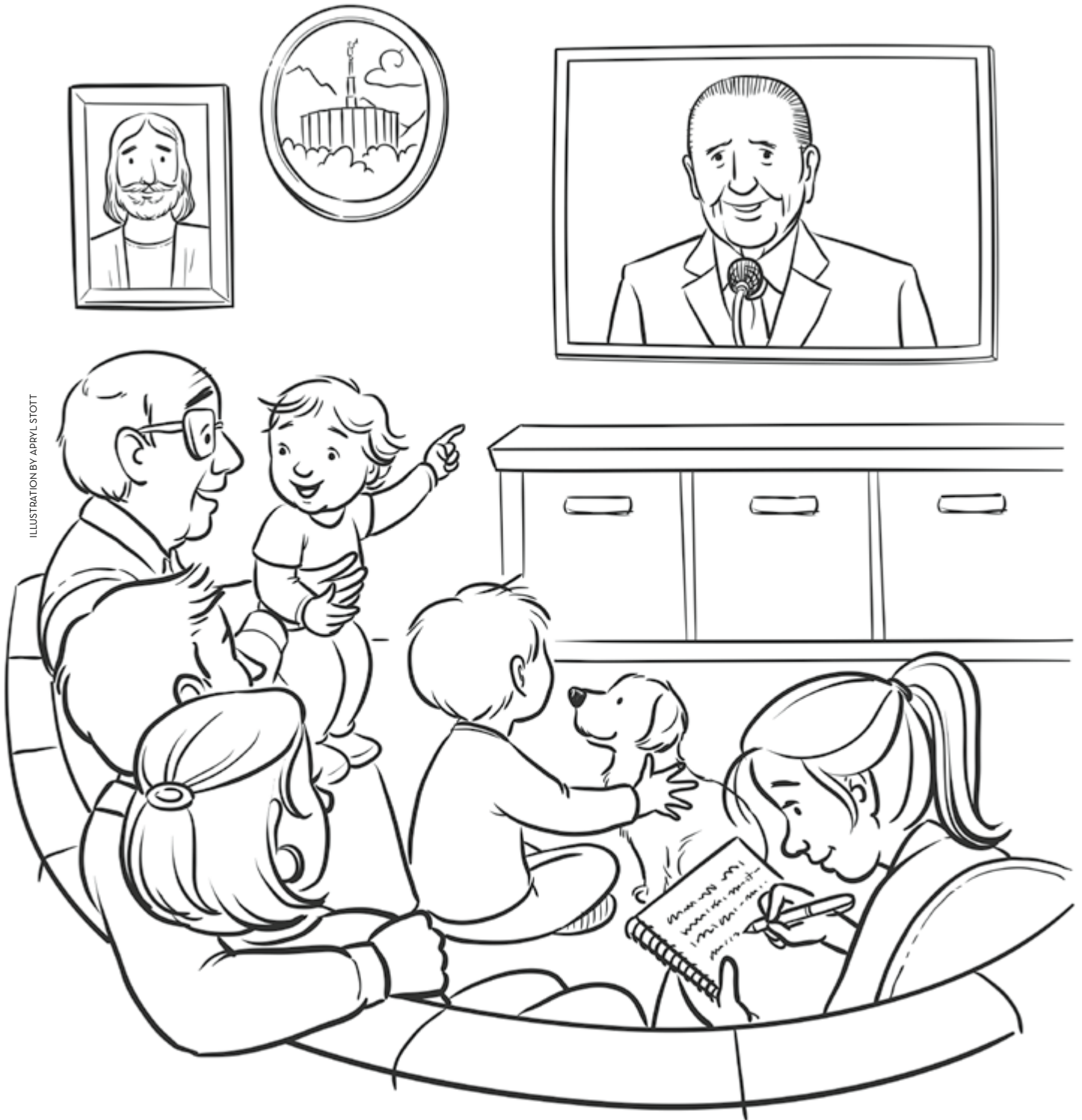
ILLUSTRATION BY APRYL STOTT

The prophets' words are always fulfilled.