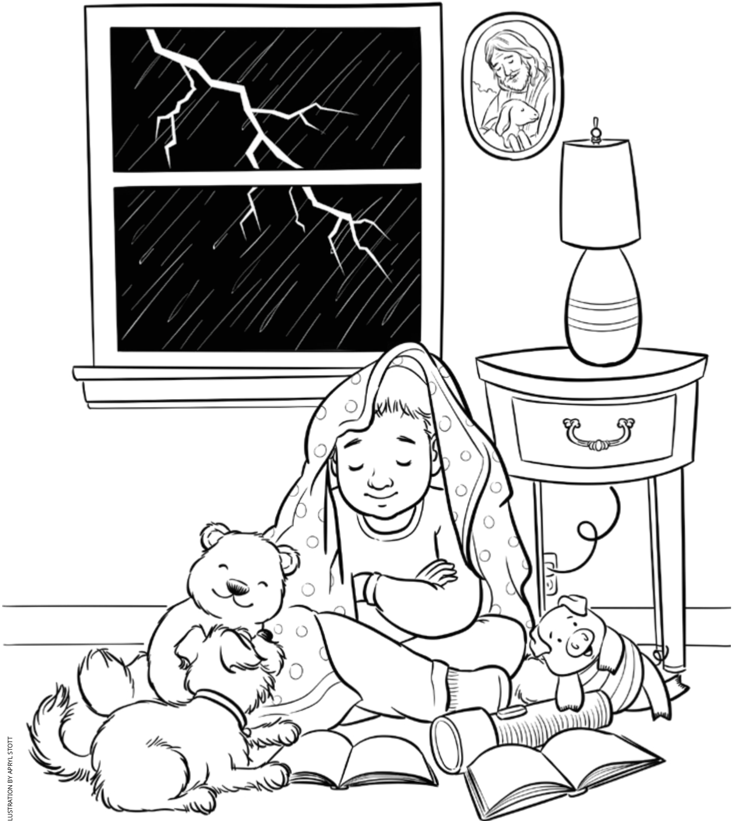
ILLUSTRATION BY APRIL STOTT