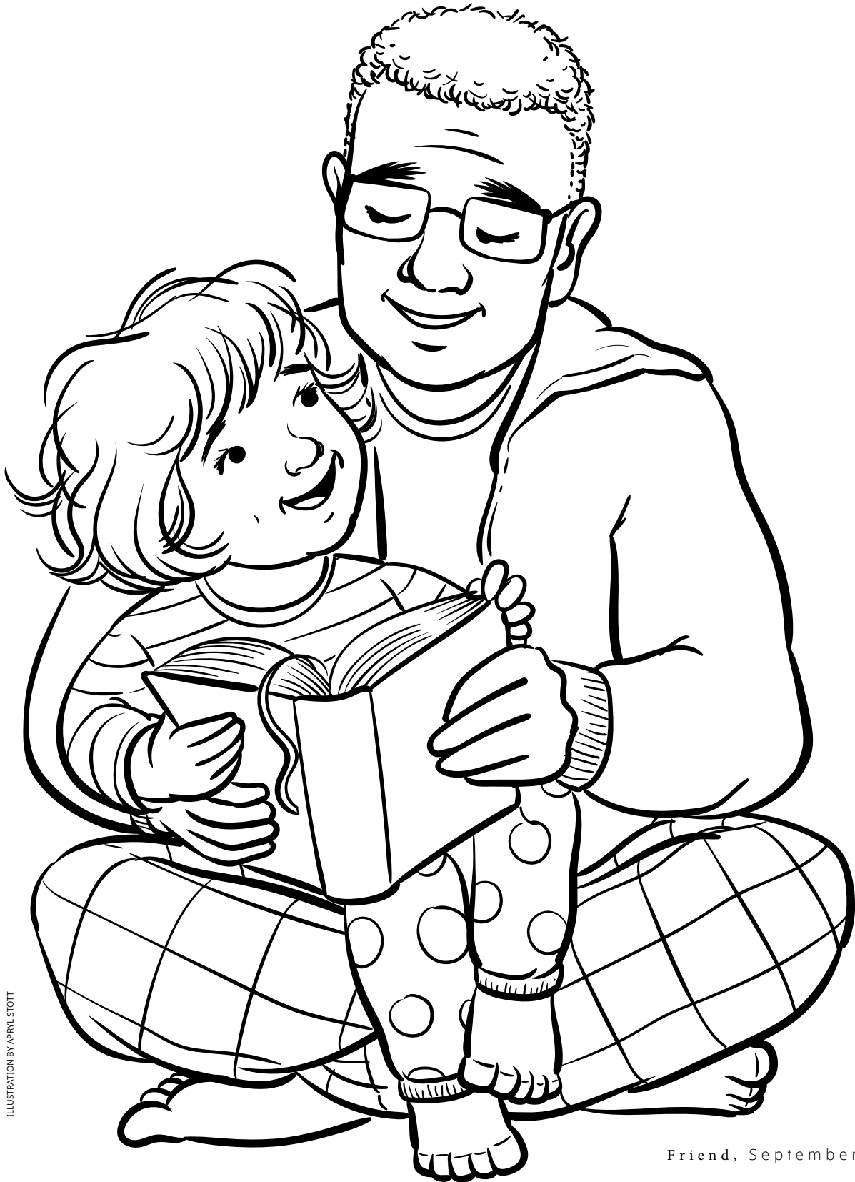
ILLUSTRATION BY APRIL STOTT

The word of God leads me to God and helps me feel His love.