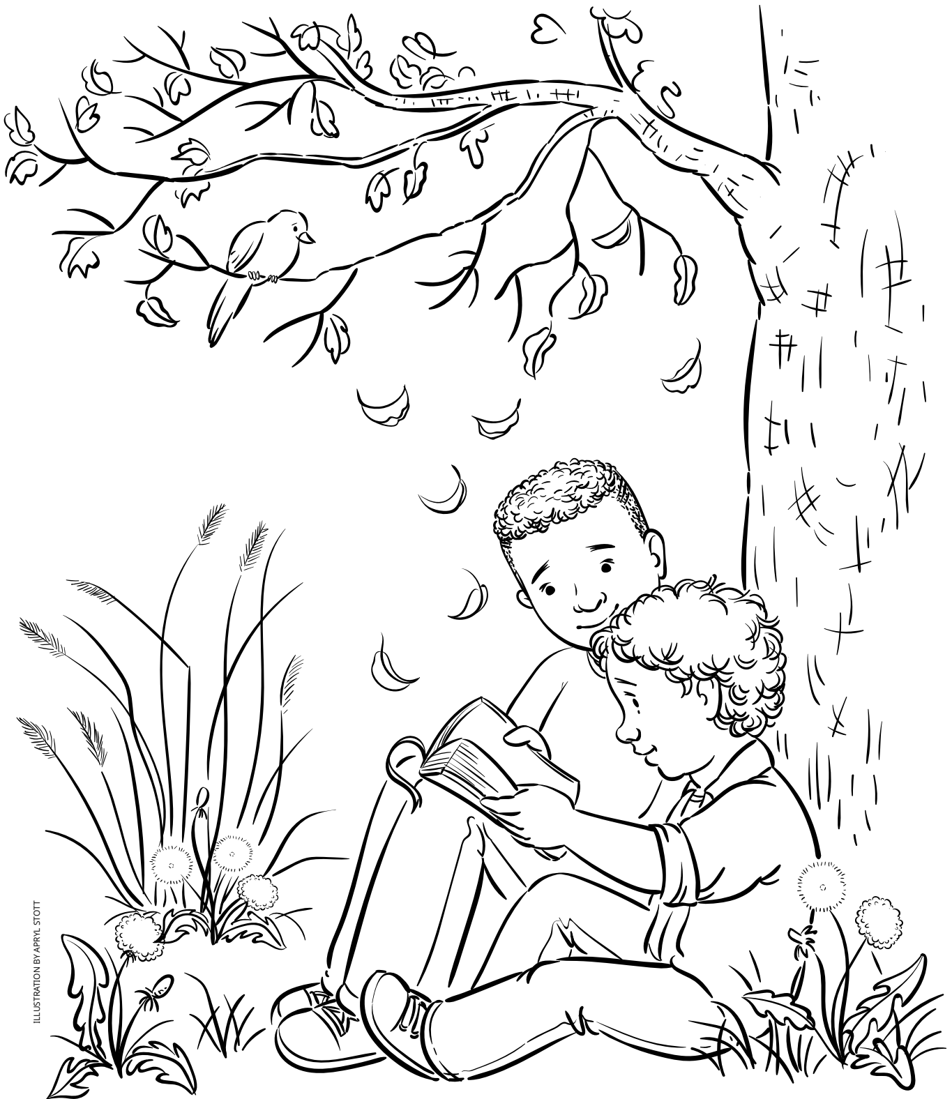
ILLUSTRATION BY APRYL SCOTT