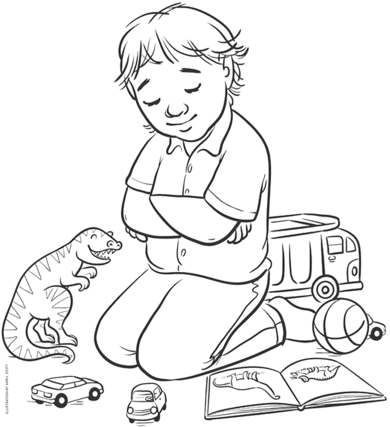
ILLUSTRATION BY APRYL SCOTT