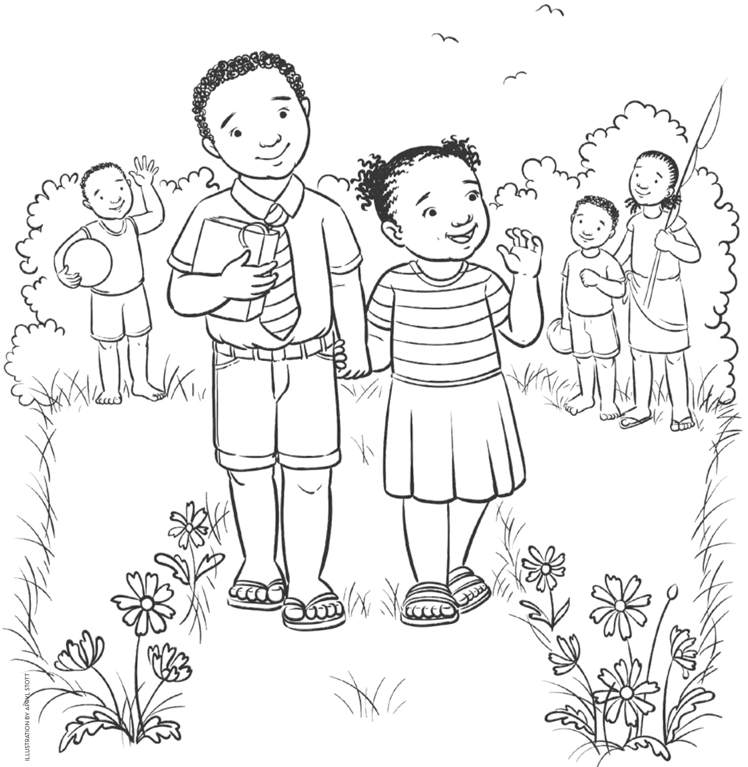
ILLUSTRATION BY APRYL STOTT