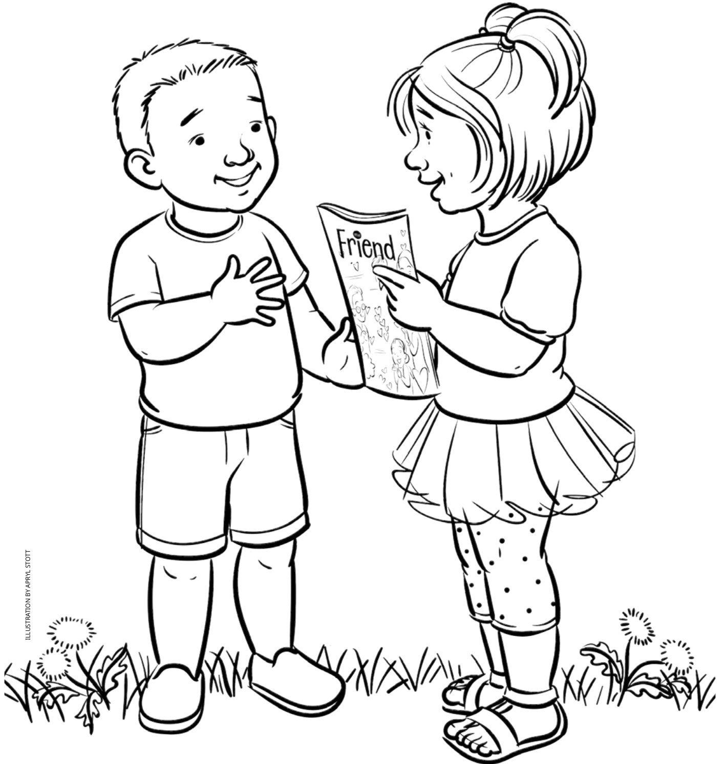
ILLUSTRATION BY APRIL STOTT