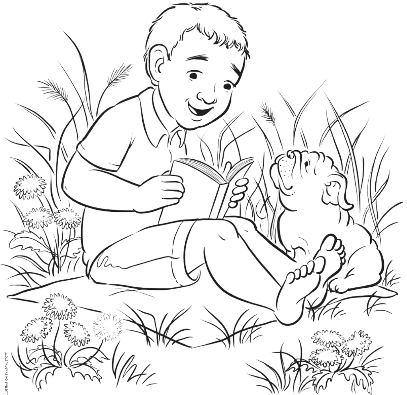
ILLUSTRATION BY APRYL STOTT