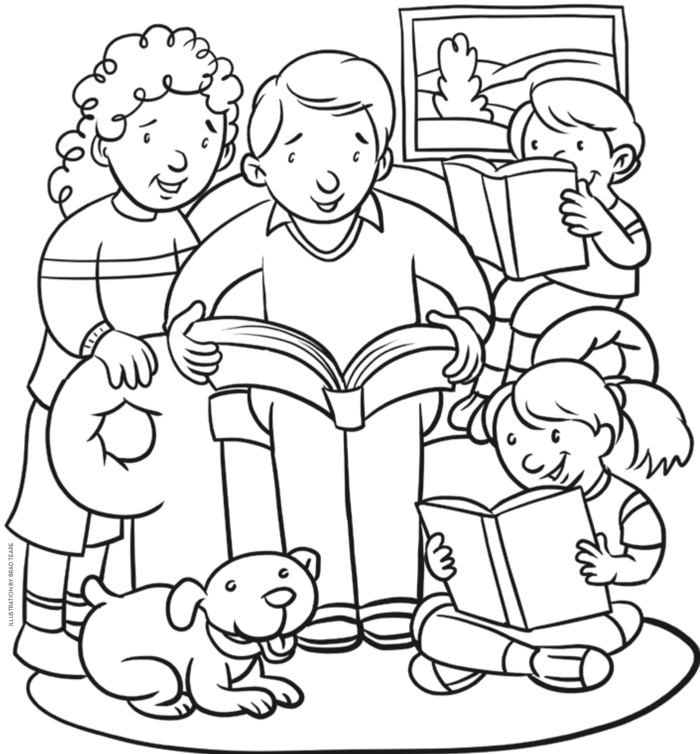
ILLUSTRATION BY BRAD TEARE

God helped people in the scriptures, and He can help me.