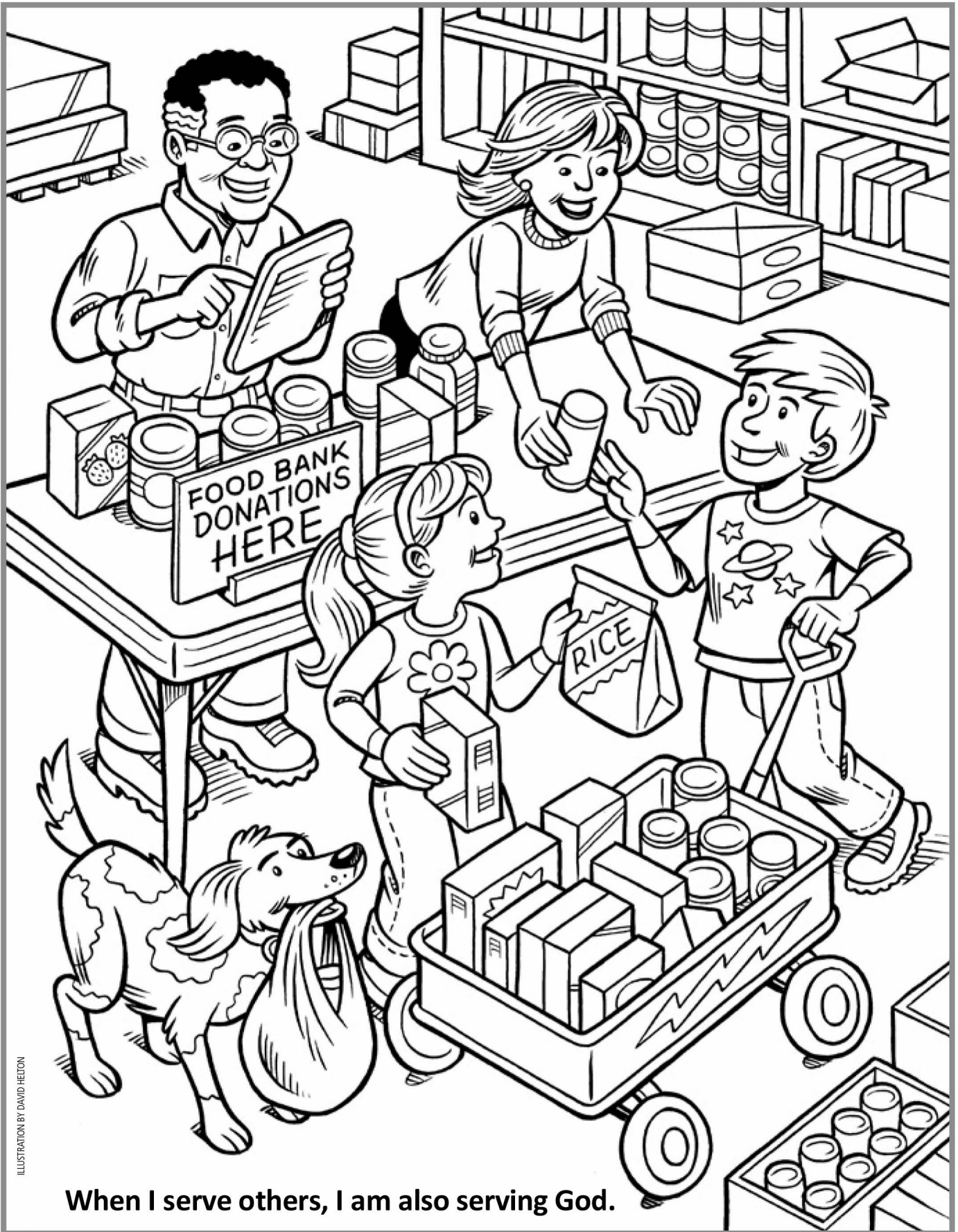
ILLUSTRATION BY DAVID HEDTON

When I serve others, I am also serving God.