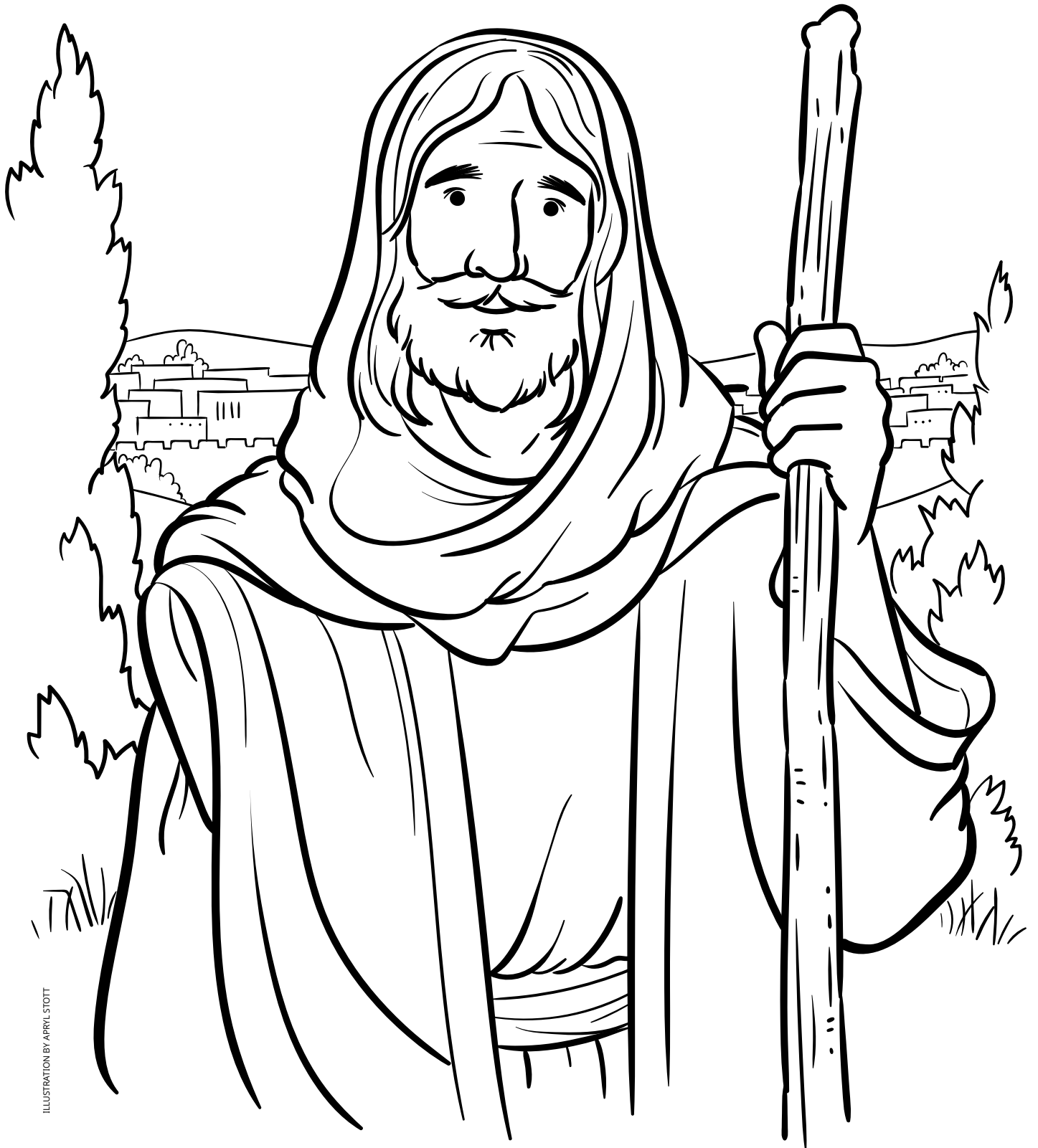
ILLUSTRATION BY APRIL STOTT