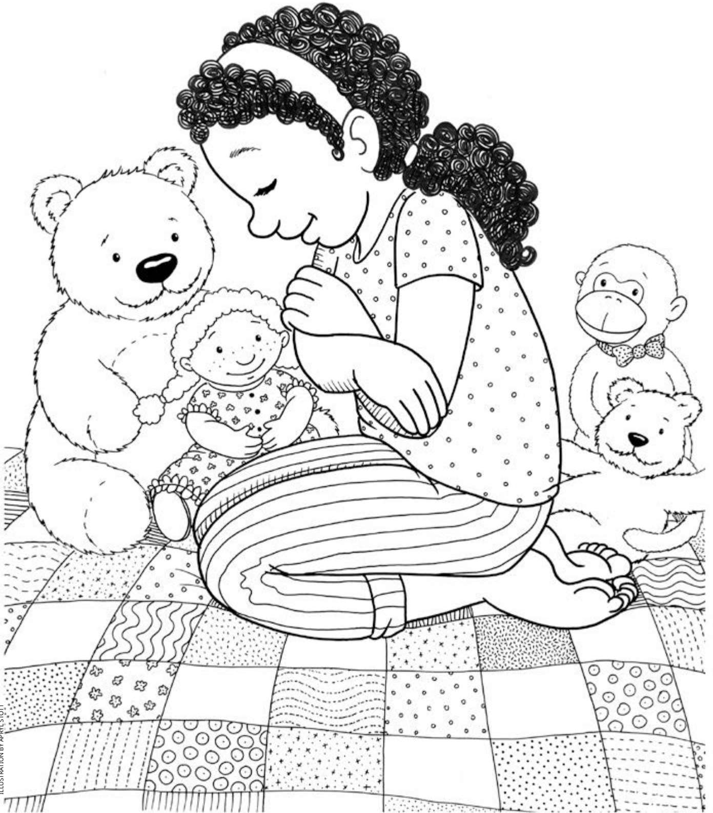
ILLUSTRATION BY APRYL STOTT

I can talk to Heavenly Father through prayer.