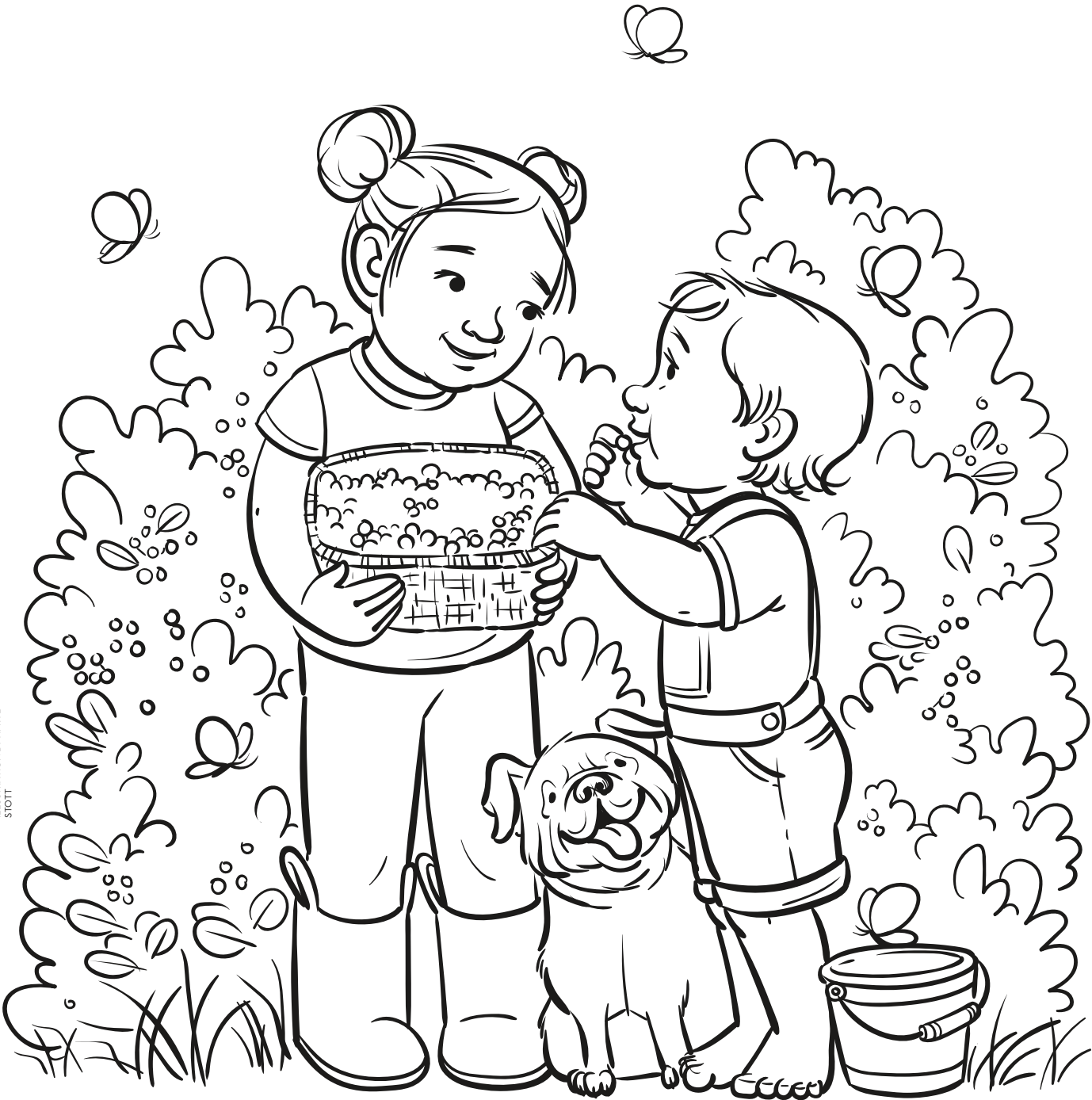
ILLUSTRATION BY APRYL STOTT

I can help others in need when I share with them.