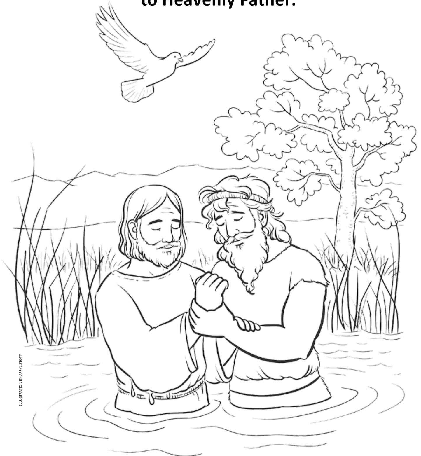
ILLUSTRATION BY APRYL STOTT