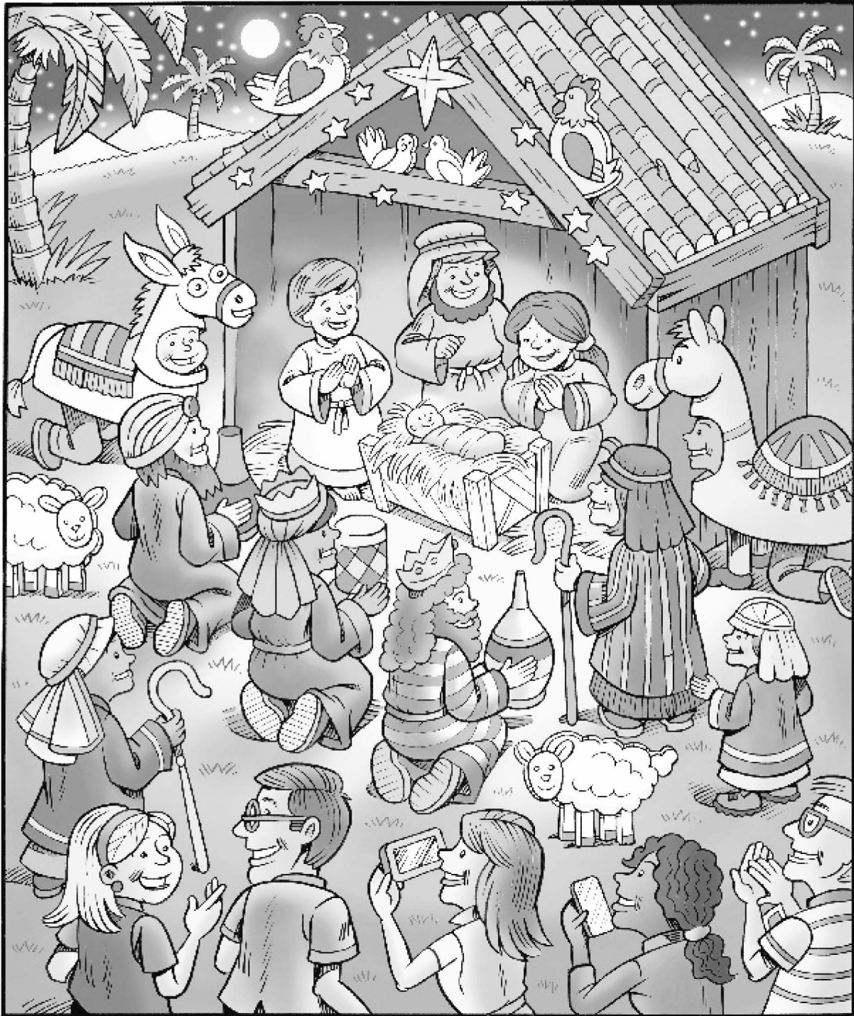
ILLUSTRATION BY DAVID HELTON

Happy Christmas! These children invited some friends to help act out a nativity scene. Can you find the hidden objects?