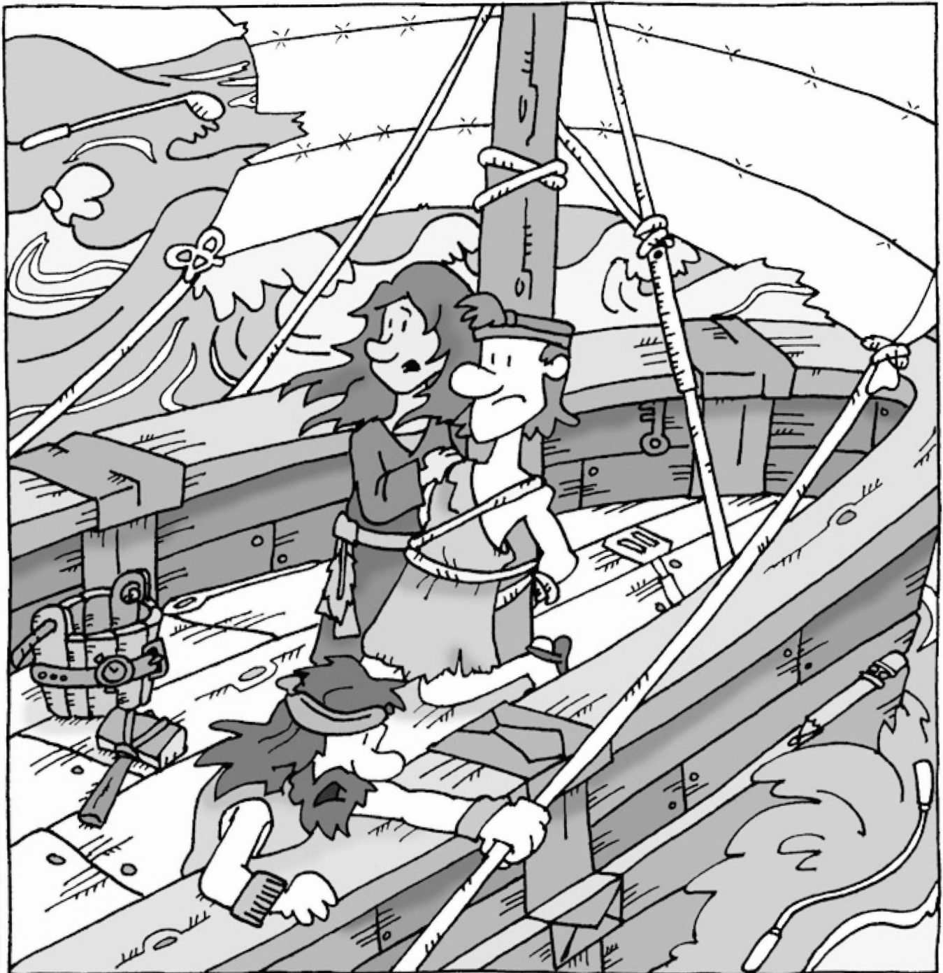
ILLUSTRATION BY ARIE VAN DE GRAAFF

Nephi's brothers Laman and Lemuel got angry at him when they were crossing the ocean. Heavenly Father sent a big storm after they tied Nephi to the boat. Can you find the hidden objects?