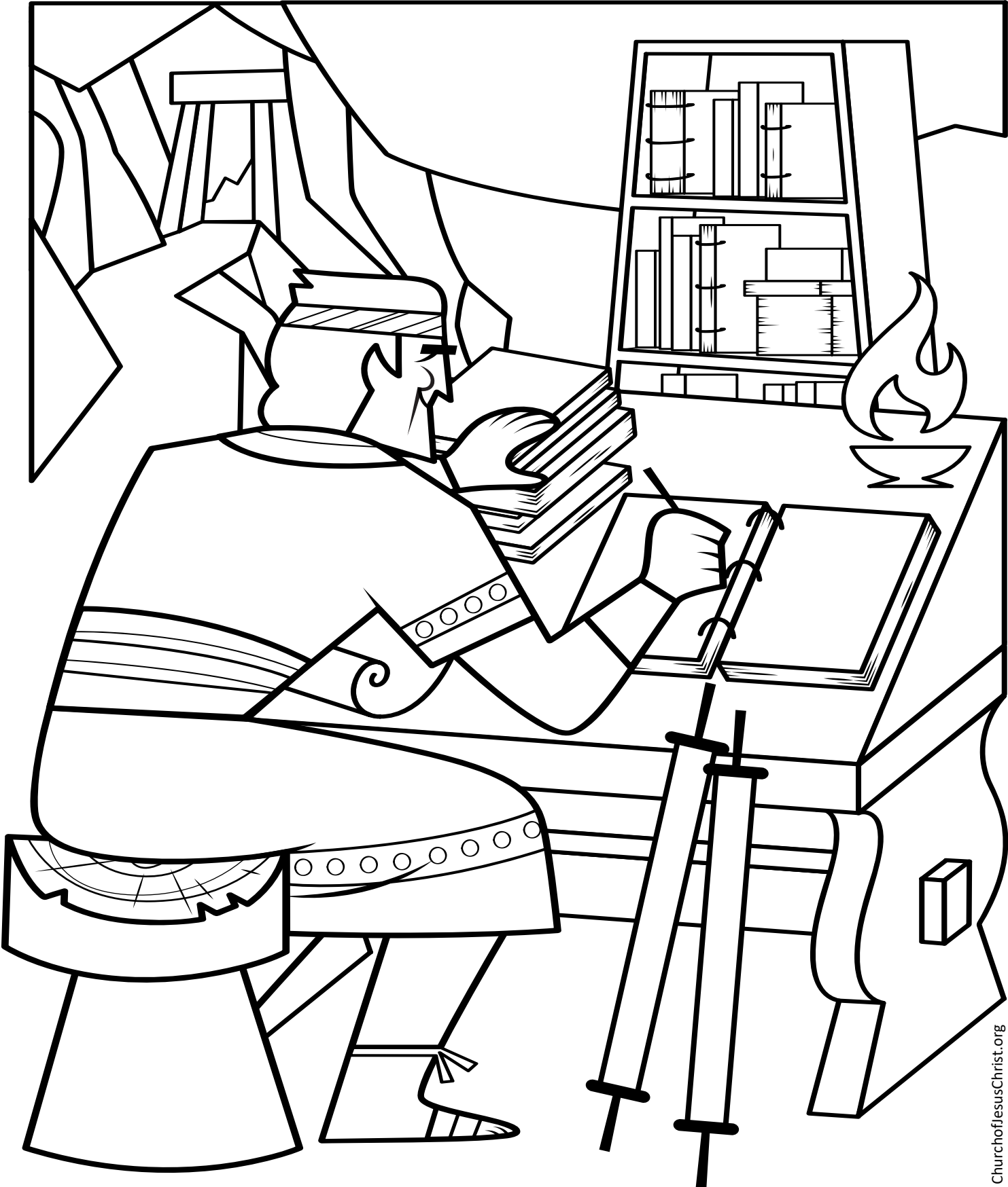
Words of Mormon 1

Color the picture of Mormon and the sacred records .