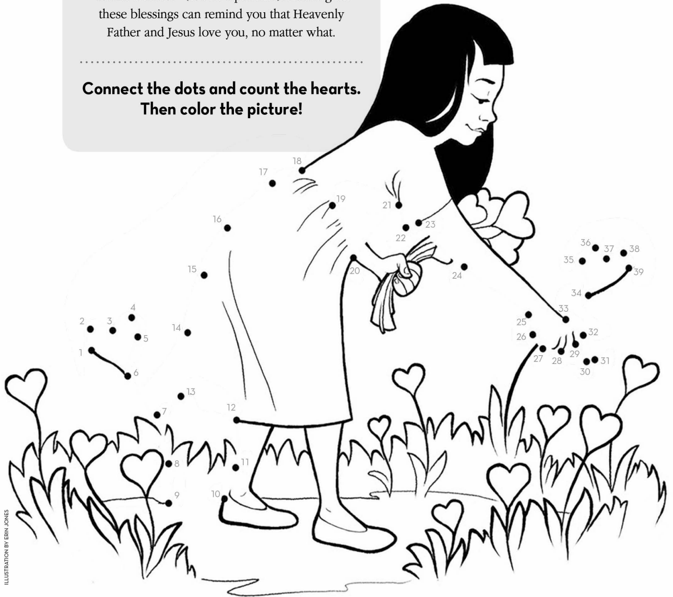
ILLUSTRATION BY ERIN JONES

Connect the dots and count the hearts. Then color the picture!