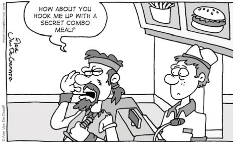
GADIANTON DINES OUT.