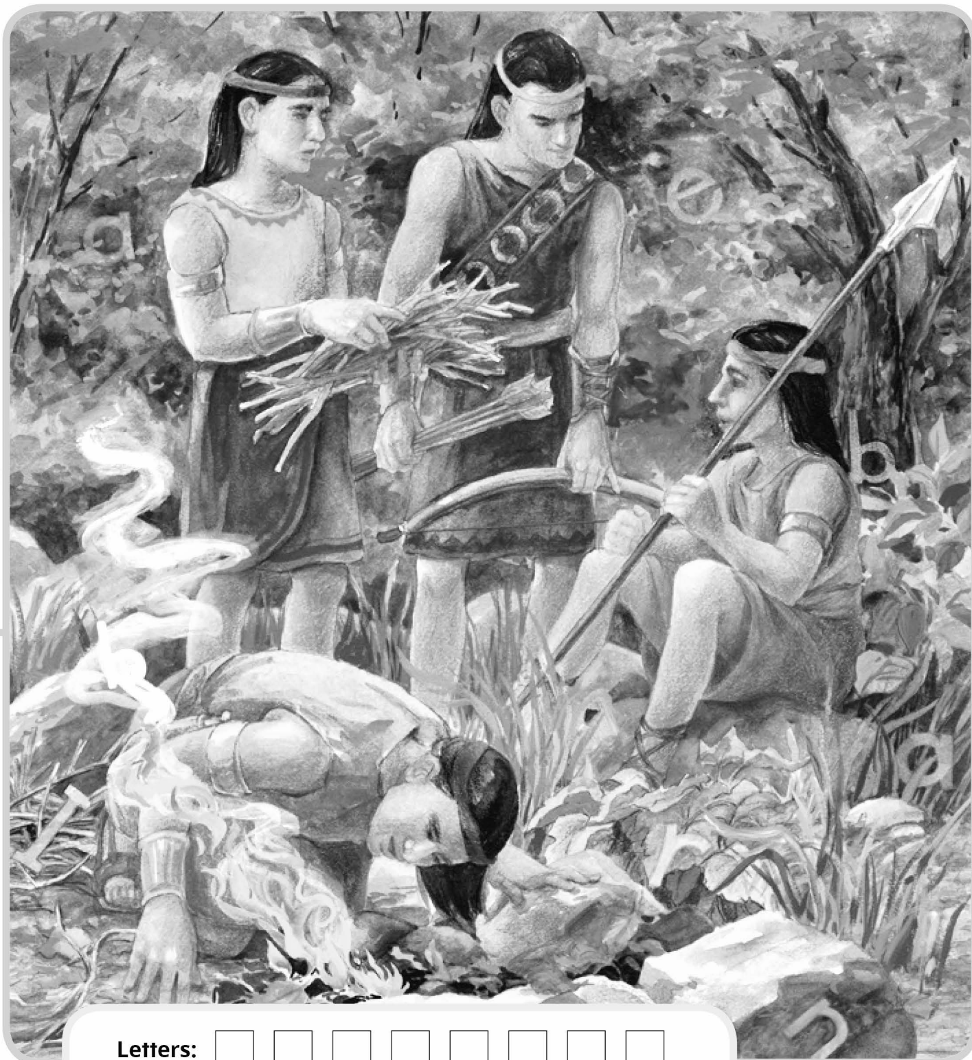
ILLUSTRATION BY MAREN SCOTT

Can you find eight letters hidden in this picture of the stripling warriors? Unscramble them and fill in the blanks to decode a hidden message.