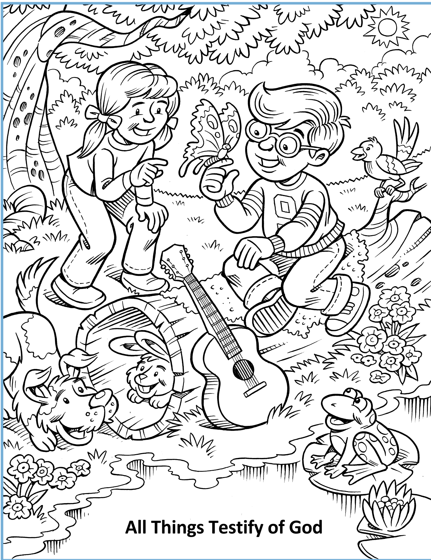
ILLUSTRATION BY DAVID HELTON