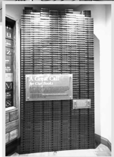
ILLUSTRATION BY ADAM WOLFORD